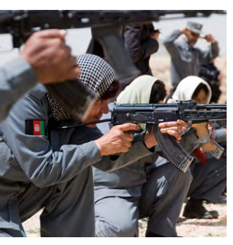
Training of Afghan female police cadets.