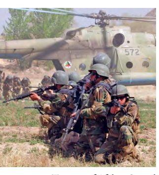
Training of Afghan Special Operations Forces.