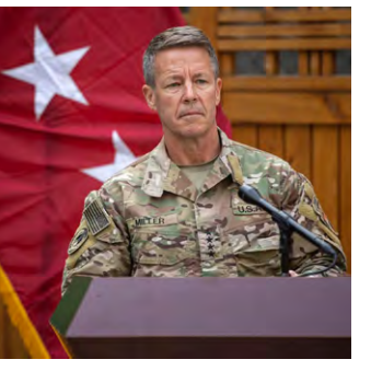
General Austin S.Miller, Commander of the NATO-led Resolute Support Mission, at Resolute Support Headquarters in Kabul.

Following the issuing of a joint declaration between the United States and the Islamic Republic of Afghanistan and the signature of an agreement between the United States and Taliban at the end of February 2020, NATO Allies and partners decided – in support to the peace process – that they would reduce their troop presence in Afghanistan in the course of the next months from around 16,000 personnel to less than 11,000.